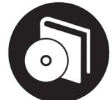
Forprompt Studio Software