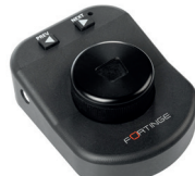
JC1 Hand Controller