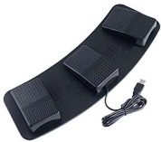
Foot Control Pedal