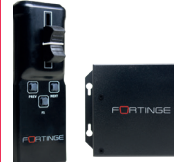
RF KIT Hand Controller