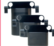
Weights W500, W1000, W2000