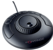
Hand Control Device